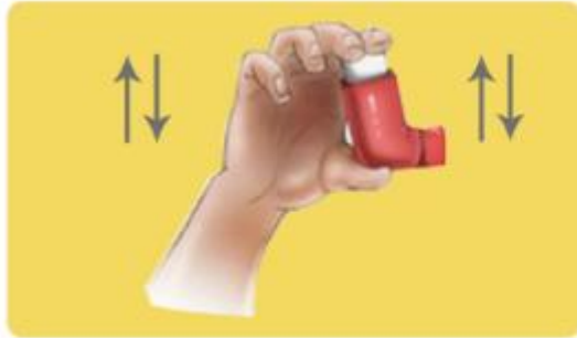
1. Shake the MDI or SMI