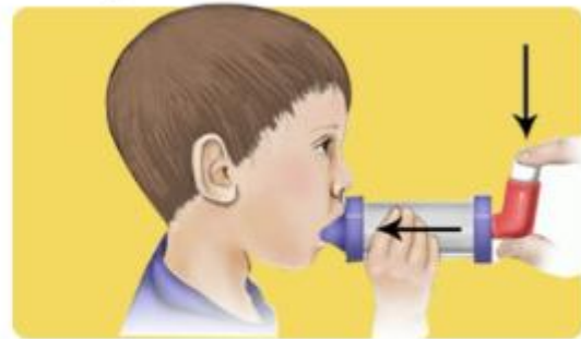
4. Breath at least 5-6 times through the mask to ensure that the med from the chamber is fully inhaled.