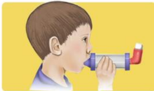
3. Place the mask over your nose and mouth securely, press the MDI or SMI.